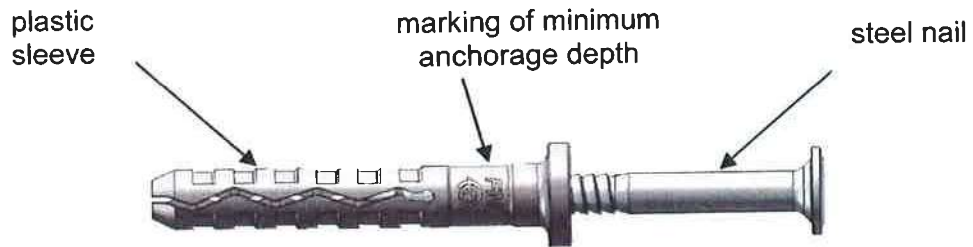
Table A1: Different sizes and combinations of plastic sleeves and steel nails